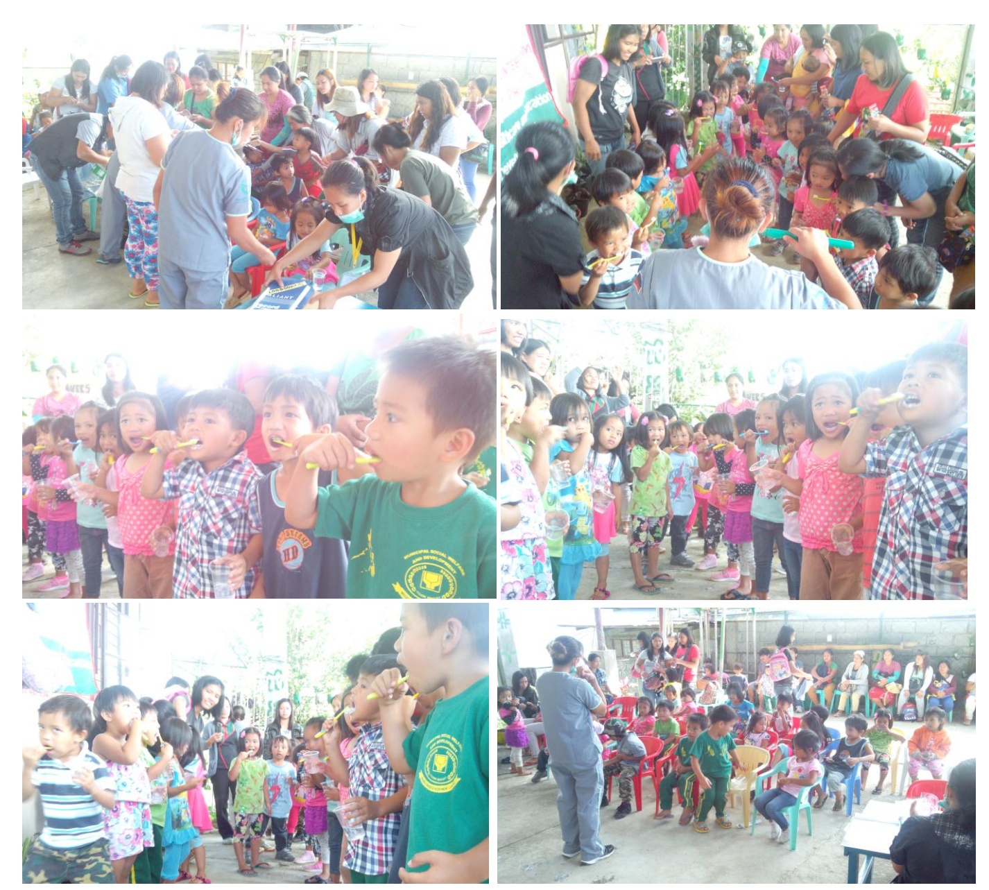
Volunteers pictorial with batch 2 children